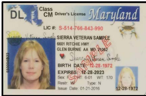
Example: Base License